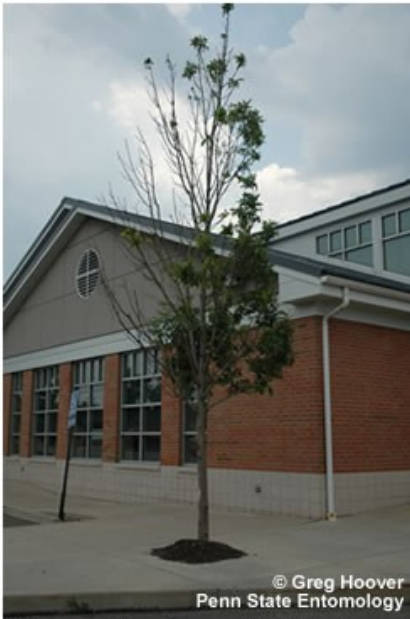
The green ash tree in a non-residential landscape where the first emerald ash borer was found in Butler County, Cranberry Township, Pennsylvania.