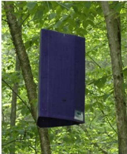
"A purple panel sticky trap in an ash tree that was hung by an Emerald Ash Borer Survey Team. These traps will be inspected for the presence of emerald ash borer adults in mid-summer and will be removed in mid- to late August."

Health, Pennsylvania Attorney General's Office, Meadville Medical Center ($500 donation), Pennsylvania Department of Agriculture, Pennsylvania Department of Environmental Protection (grant for 50% of total expenses), Crawford County District Attorney's Office ($250 donation from Drug Forfeiture Account), Crawford County Sheriff's Department, and the Crawford County Retired & Senior Volunteer Program.