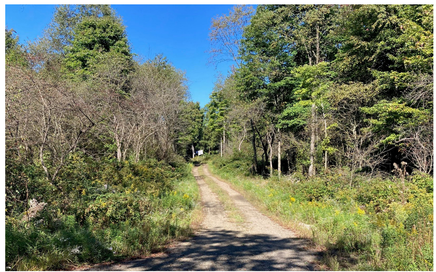
East Branch Trail, Eastern Crawford County