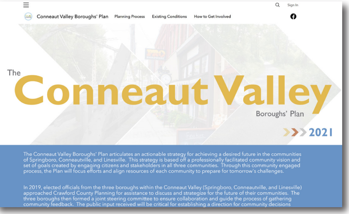
Conneaut Valley Project Website

Beginning in the Spring of 2022, community residents and stakeholders within each borough will be engaged in a series of events to establish a community vision.