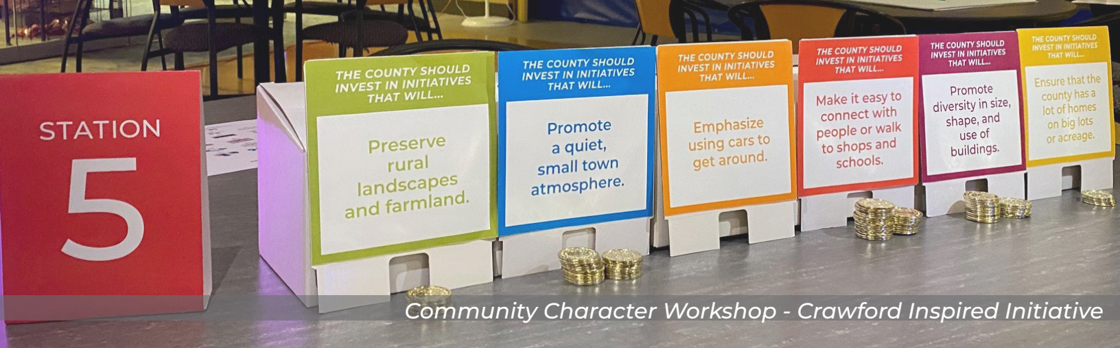
Community Character Workshop - Crawford Inspired Initiative