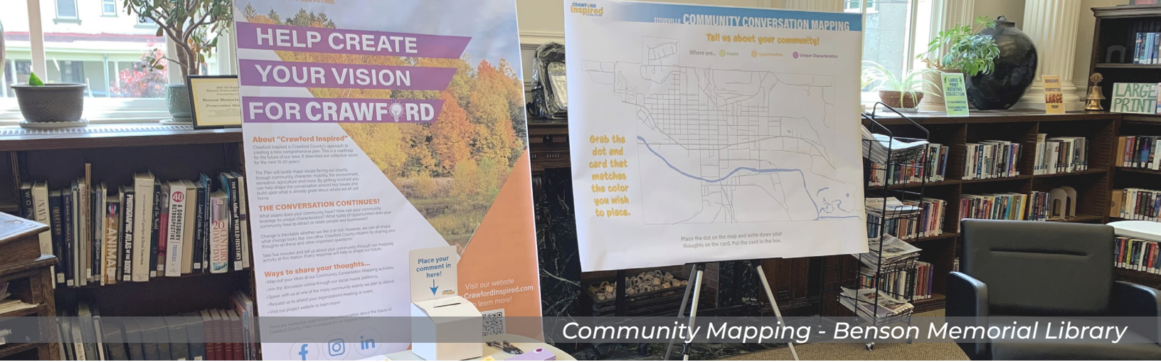
Community Mapping - Benson Memorial Library